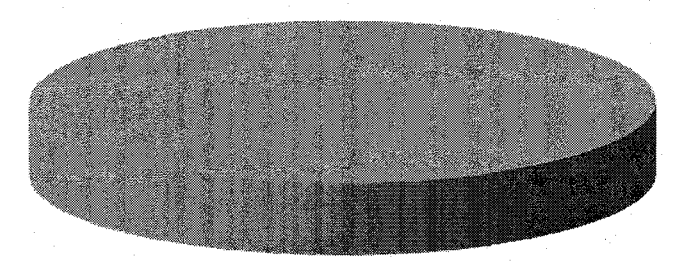
Office of the Governor, $3,848,053, 100%